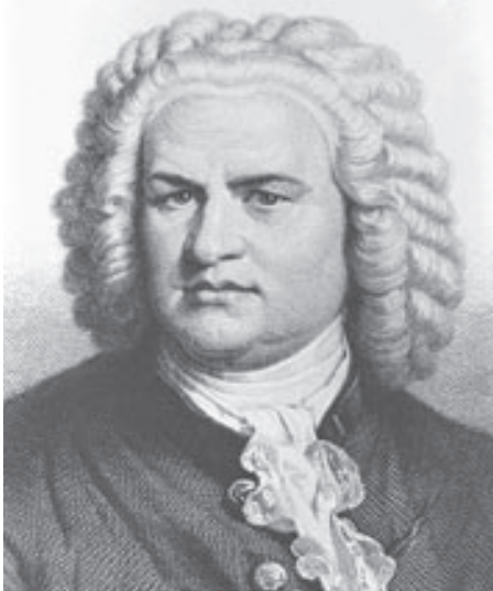
Johann Sebastian Bach

Bach wrote all kinds of music - for organ, orchestras, choirs and many different instrument combinations. Some of his best known works are the Tocatta and Fugue in D Minor and the Brandenburg Concertos . He is now seen as one of the greatest geniuses in music history.