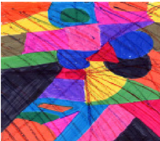
Spring by Erica, Cincinnati OH